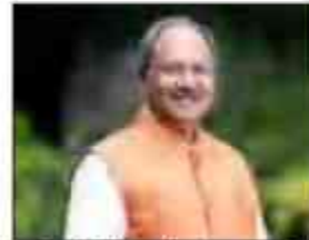
Shri Brijmohan Agrawal Member of Parliament