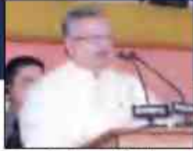
Dr. Raman Singh Ex- Chief Minister, Chhattisgarh