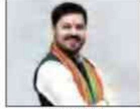
Padma Shree Shri Anuj Sharma Renowned Actor & Politician