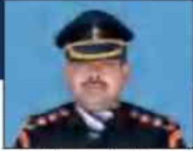
Honorary Captain Yogendra Singh Yadav, PVC Param Veer Chakra Awardee