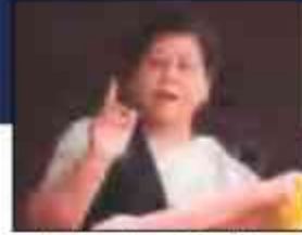
Sushree Anusuiya Uikey Ex- Governor, Chhattisgarh