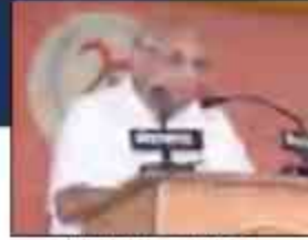
Shri Ramesh Bais Ex- Governor, Maharashtra