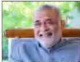
Shri Kamlesh Patel (Daaji) President, Shri Ramchandra Mission