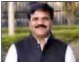
Shri Pramod Dubey Ex- Mayor, Raipur